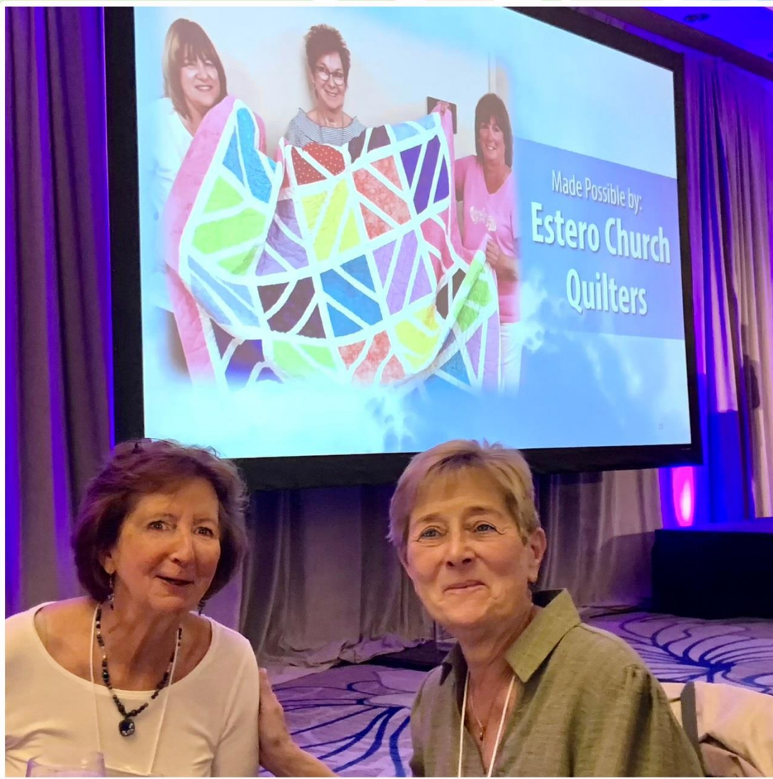
Estero Church Luncheon Table