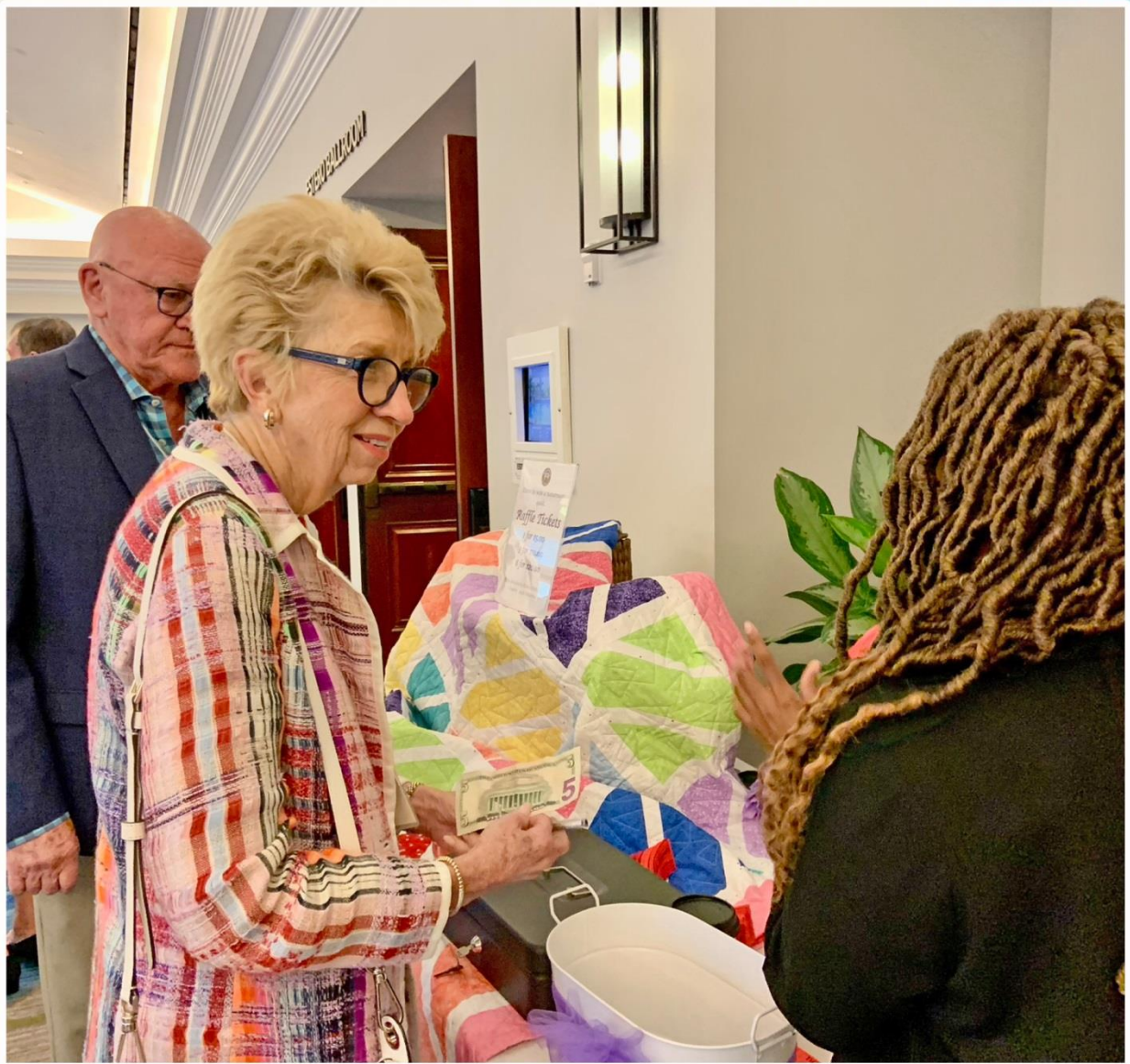
Eager raffle participants at luncheon